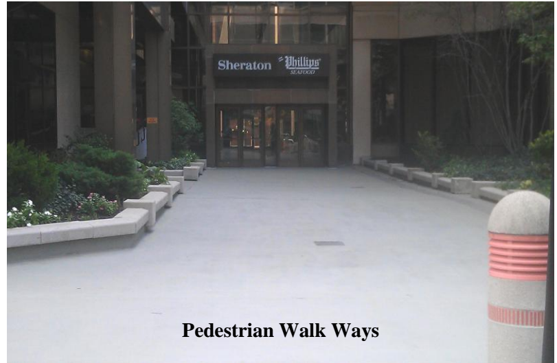
Pedestrian Walk Ways